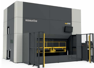
TLH: 3D-laser cutting machine

the press-formed parts of high-tensile steel. “Our TLH 3D laser cutting machine is the best solution for trimming hot-formed parts,” says president Yasushi Kitade.