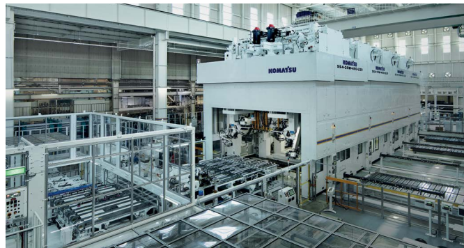
Large-sized Servo Press line for stamping automotive body panels