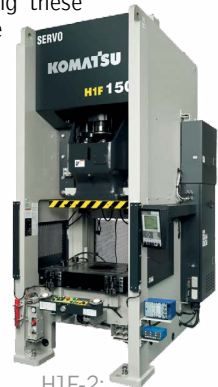
H1F-2: Small-sized Servo Press